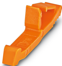
Latching, length: 28.9 mm, width: 3.3 mm, number of positions: 1, color: orange

Please be informed that the data shown in this PDF Document is generated from our Online Catalog. Please find the complete data in the user's documentation. Our General Terms of Use for Downloads are valid ( http://phoenixcontact.com/download )