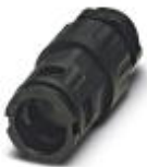
Cable gland, metric thread, IP68/69k protection, with strain relief

Screw connection - WP-GR HF IP69K M32 BK - 3240942