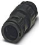
Cable gland, metric thread, IP66 protection, with strain relief

Screw connection - WP-GR HF IP66 M32 BK - 3240956