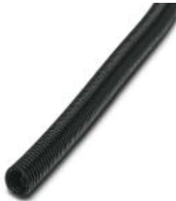
Polyamide protective hose, inflammability class HB, UV resistant, 1 Pcs. / Pkt. = roll à 25 m

Please be informed that the data shown in this PDF Document is generated from our Online Catalog. Please find the complete data in the user's documentation. Our General Terms of Use for Downloads are valid ( http://phoenixcontact.com/download )