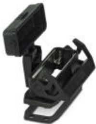
HEAVYCON EVO panel mounting base, plastic, D25, with single locking latch, flat gasket, and protective cover

Please be informed that the data shown in this PDF Document is generated from our Online Catalog. Please find the complete data in the user's documentation. Our General Terms of Use for Downloads are valid ( http://phoenixcontact.com/download )