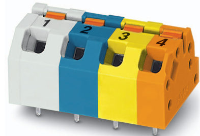
The figure shows the standard item (without EX marking)

PCB terminal block, Push-in spring connection