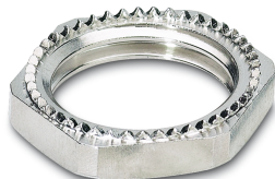
EMV nut, Threads, M16 x 1.5

Please be informed that the data shown in this PDF Document is generated from our Online Catalog. Please find the complete data in the user's documentation. Our General Terms of Use for Downloads are valid ( http://phoenixcontact.com/download )