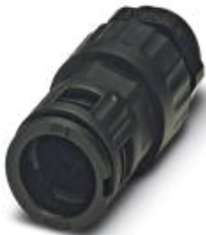
Cable gland, Pg thread, IP66 protection, with strain relief

Please be informed that the data shown in this PDF Document is generated from our Online Catalog. Please find the complete data in the user's documentation. Our General Terms of Use for Downloads are valid ( http://phoenixcontact.com/download )