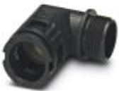
Cable gland, metric thread, IP68/69k protection, angled

Screw connection - WP-GA HF IP69K M20 BK - 3240912