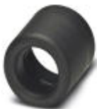
End sleeves as cable protection

Cable protection end sleeve - WP-SC PA HF 21,2 BK - 3240984