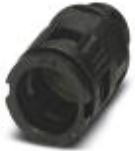
Cable gland, metric thread, IP68/69k protection, straight

Screw connection - WP-G HF IP69K M20 BK - 3240884