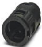
Cable gland, metric thread, IP66 protection, straight

Screw connection - WP-G HF IP66 M20 BK - 3240898