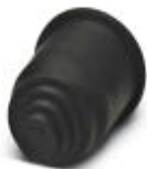
End sleeves, transition sleeves, from hose to cable

Transition sleeve from hose to cable - WP-EC TPE HF 21,2 BK - 3240977