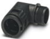
Cable gland, metric thread, IP66 protection, angled

Screw connection - WP-GA HF IP66 M20 BK - 3240926