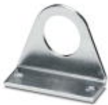
Fixing bracket for protective sleeves, fixed with two screws

Protective hose fixing bracket - WP-BASE A PG16 - 3241079