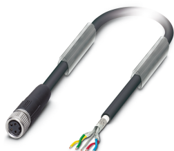
Bus system cable, INTERBUS, 4-position, PUR halogen-free, black RAL 9005, shielded, free cable end, on Socket straight M8, cable length: 10 m

Please be informed that the data shown in this PDF Document is generated from our Online Catalog. Please find the complete data in the user's documentation. Our General Terms of Use for Downloads are valid ( http://phoenixcontact.com/download )