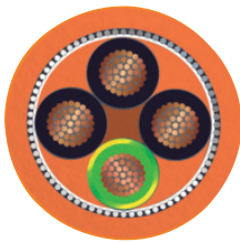
PUR halogen-free orange shielded [PUR]