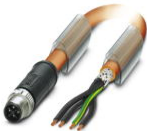
Sensor/Actuator cable, 4-position, PUR halogen-free, Orange (RAL 2003), matt, shielded, Plug straight M12 SPEEDCON, S-coded, on Free cable end, Cable length: 10 m

Please be informed that the data shown in this PDF Document is generated from our Online Catalog. Please find the complete data in the user's documentation. Our General Terms of Use for Downloads are valid ( http://download.phoenixcontact.com )