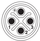
M12 plug pin assignment, 4-pos., S-coded, plug side view