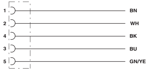
Contact assignment of the M12 plug and the M12 socket