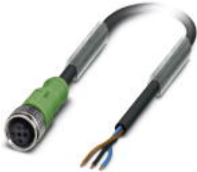
Sensor/Actuator cable, 5-position, PUR/PVC, Black-gray RAL 7021, shielded, Free cable end, on Socket straight M12, A-coded, Cable length: 5 m

Please be informed that the data shown in this PDF Document is generated from our Online Catalog. Please find the complete data in the user's documentation. Our General Terms of Use for Downloads are valid ( http://download.phoenixcontact.com )