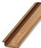
DIN rail, material: Copper, unperforated, height 7.5 mm, width 35 mm, length: 2 m

DIN rail - NS 35/ 7,5 CU UNPERF 2000MM - 0801762