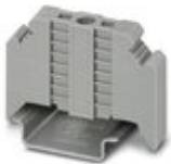
End clamp, width: 9.5 mm, color: gray