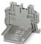
Quick mounting end clamp for NS 35/7,5 DIN rail or NS 35/15 DIN rail, with marking option, with parking option for FBS...5, FBS...6, KSS 5, KSS 6, width: 5.15 mm, color: gray