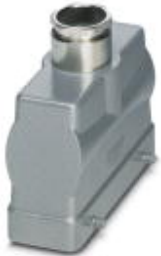
HEAVYCON B24 sleeve housing, for double locking latch, height: 76 mm, with 1 x M32 screw connection, straight cable outlet

Please be informed that the data shown in this PDF Document is generated from our Online Catalog. Please find the complete data in the user's documentation. Our General Terms of Use for Downloads are valid ( http://download.phoenixcontact.com )