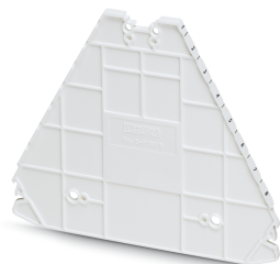
End cover, length: 100 mm, width: 2.2 mm, height: 80.8 mm, color: white

Please be informed that the data shown in this PDF Document is generated from our Online Catalog. Please find the complete data in the user's documentation. Our General Terms of Use for Downloads are valid ( http://phoenixcontact.com/download )