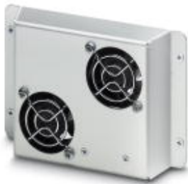
Fan module for Remote Field Controllers RFC 430 ETH-IB / RFC 450 ETH-IB

Please be informed that the data shown in this PDF Document is generated from our Online Catalog. Please find the complete data in the user's documentation. Our General Terms of Use for Downloads are valid ( http://phoenixcontact.com/download )