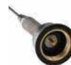
Pogo Pin Base

The most commonly used cable assembly/mount is the NMOKHFUD (27 MHz to 6 GHz) with 17' of UD (RG-58/U Dual Shield).