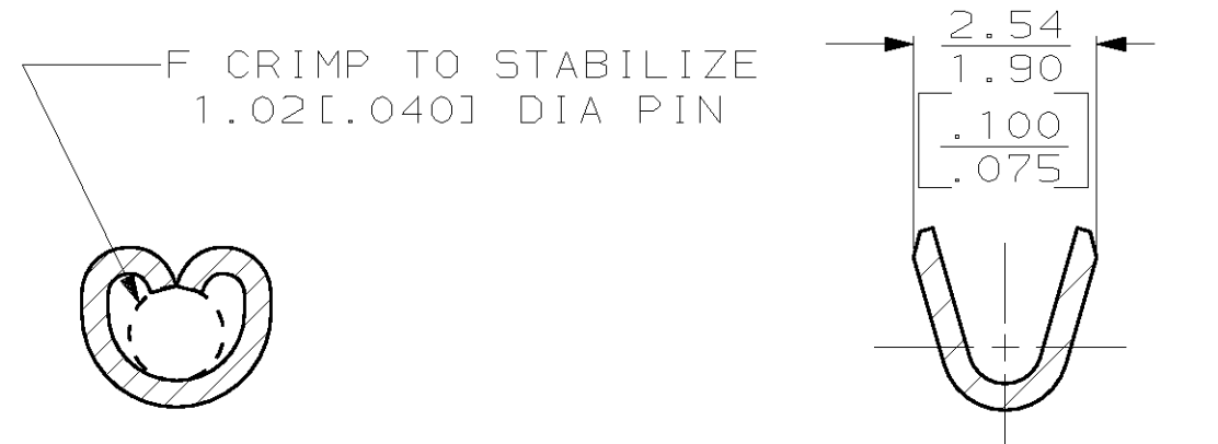
SECTION C-C SCALE 10:1