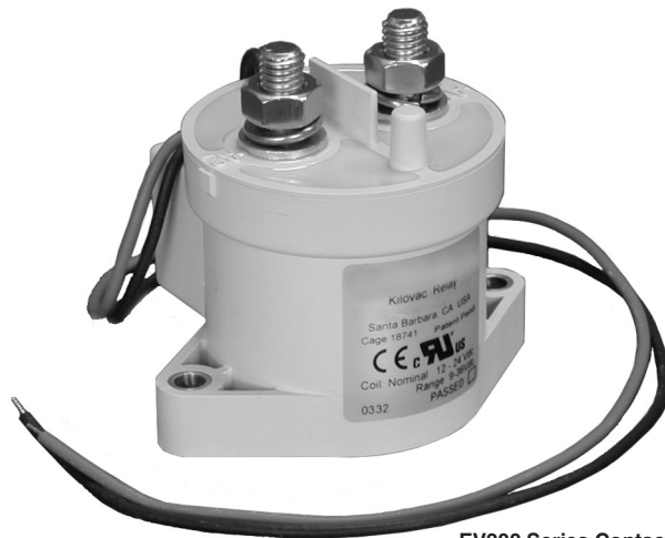
EV200 Series Contactor (CZONKA Relay, Type)