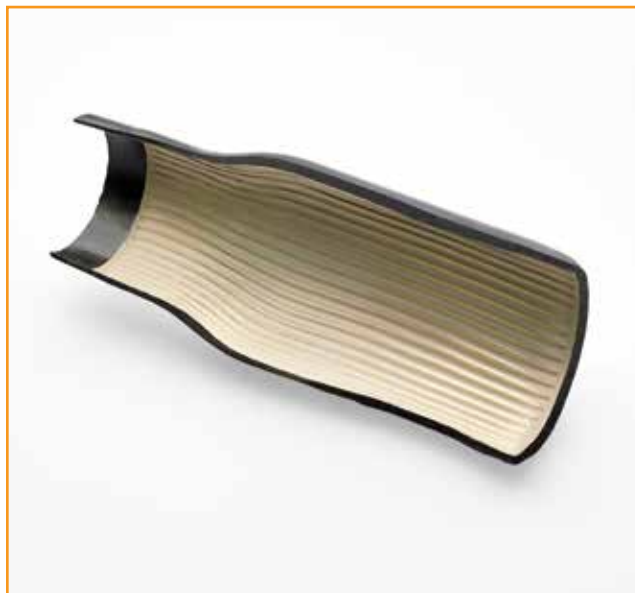
Cross Sectional Area