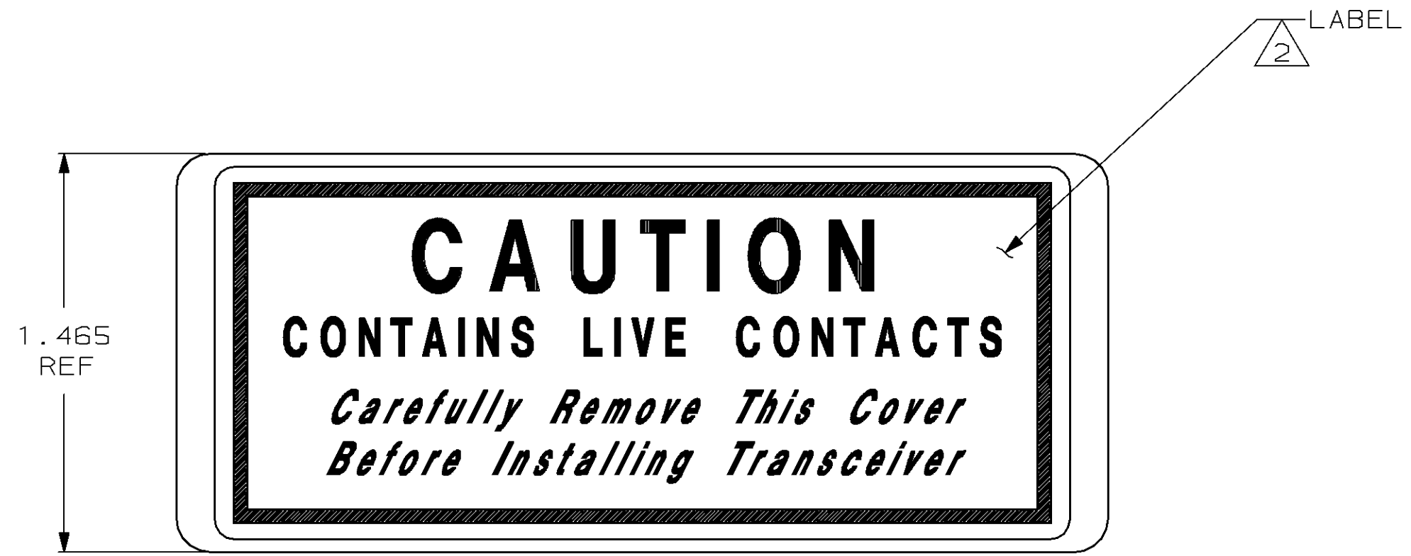
221057-1 LABEL AS SHOWN VIEW A