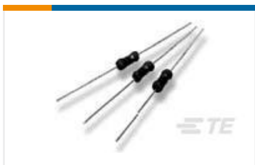
TE Part #4-1625892-9 3W SM M/OX 5% 3R3