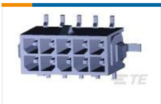
TE Part #4-794637-0 10P MICRO MNL ASSY,VRT,SMT LF