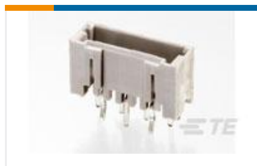
TE Part #292207-9 MINI CT SGL DIP V 9P NAT