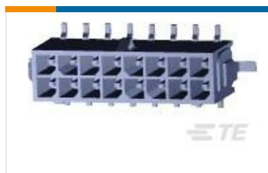
TE Part #4-794637-6 16P MICRO MNL ASSY,VRT,SMT LF