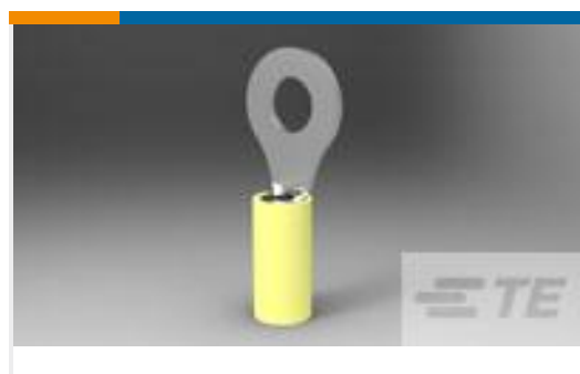
TE Part #2-320569-3 TERM, RT, PIDG, 12-10, 1/4, T&R