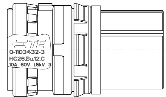
PN 0-3 AS SHOWN