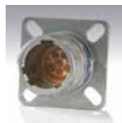
Square Flange Receptacle