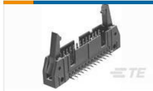
TE Part #5499345-8 A/L UNIV HDR 34P RA SHT LAT