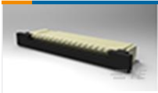
TE Part #1-84953-5 1MM FPC HORZ.TOP CONT.ASSY 15P