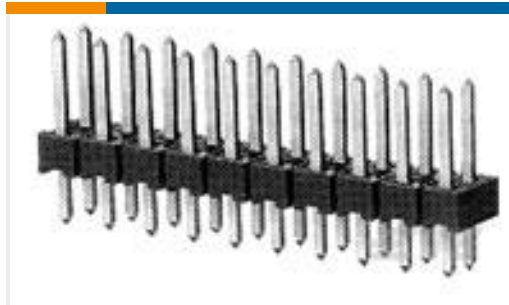
TE Part #5-146252-1 02 MODII HDR DRST B/A .100 LF