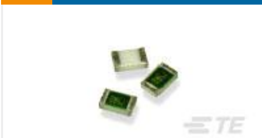
TE Part #1-1879208-2 CPF 0402 30R 0.1% 25PPM 1K RL