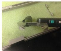
INCORRECT ID TUBING IS STRETCHED

When the tubing is expanded it becomes a lighter color. Black can become grey, red can turn more of a pink color, etc. What this means is that the color as received may not be the final color after it is recovered. This is not a defect, as color is judged on the recovered tubing, not the as received (or fully expanded) tubing. A sample should be cut, fully recovered and allowed to cool to properly evaluate the color.