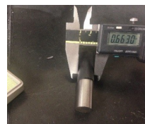
CORRECT OD PLUG GAGE KEEPS TUBING FROM BEING SQUEEZED