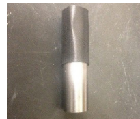
CORRECT ID PLUG GAGE KEEPS TUBING ROUND