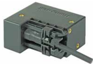
Figure 3. Ten mounting holes on five of six sides