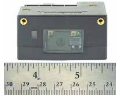
Figure 2. Slider bracket holding micro-USB cable